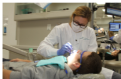
Free Dental Clinic

Come learn about new ways that people in your church can serve in ministry: